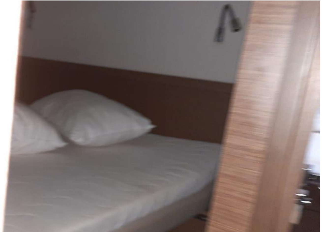
que du bonheur. 26 août, 2024 12:22